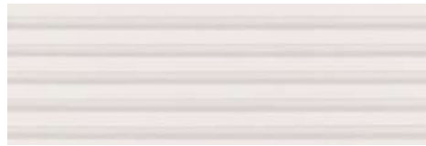
CAST GREY LIGHT