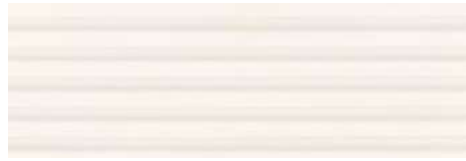
CAST TAUPE LIGHT