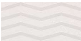
SAW GREY LIGHT

CHALK GREY LIGHT 30x60 cm/11.8"x24" RC ↘