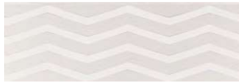
SAW GREY LIGHT