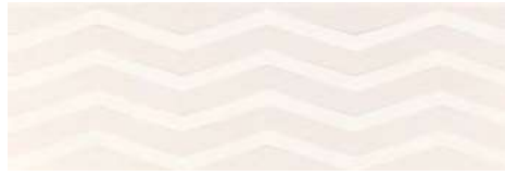
SAW TAUPE LIGHT

AVAILABLE FORMATS. / FORMATOS DISPONIBLES.