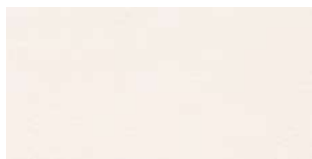
CHALK TAUPE LIGHT