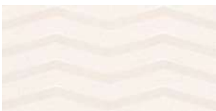
SAW TAUPE LIGHT