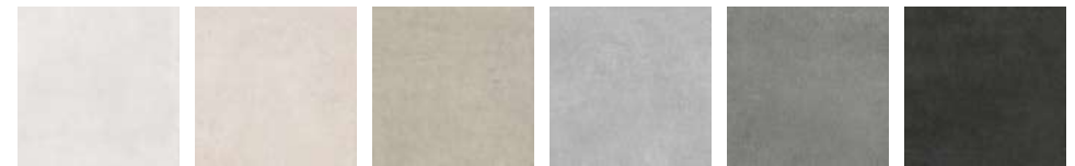
GRAVEL WHITE GRAVEL CREAM GRAVEL EARTH GRAVEL GREY GRAVEL SHADOW GRAVEL BLACK

120x120 cm/48"x48" + 90x90 cm/36"x36" + 75x150 cm/30"x60" + 75x75/30"x30" + 60x120 cm/24"x48" + 60x60 cm/24"x24" + 30x60 cm/11.8"x24"