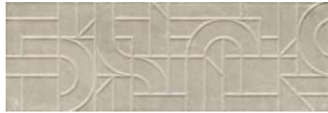
MANHATTAN ROAD BEIGE