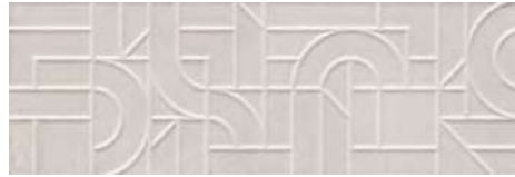
MANHATTAN ROAD IVORY