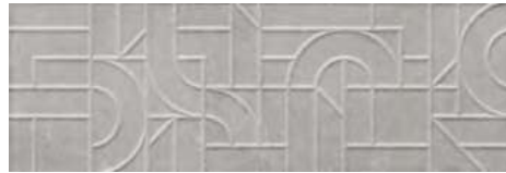
MANHATTAN ROAD GREY