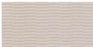
BLUNT MOSAIC CREAM