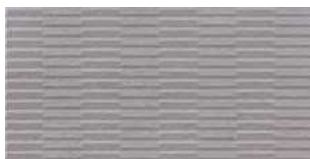
BLUNT MOSAIC ANTRACITE