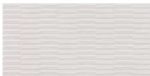
BLUNT MOSAIC WHITE