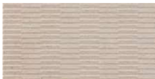
BLUNT MOSAIC TAUPE

AVAILABLE FORMATS / FORMATOS DISPONIBLES: