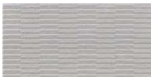
BLUNT MOSAIC GREY