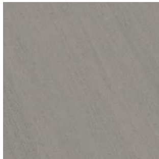
KURSAAL EXTREM SLATE