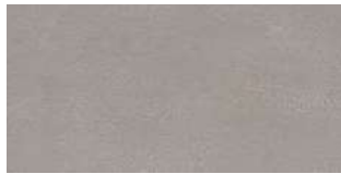
WAVE WALL CONCRETE