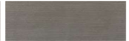
WAVE RESIN PLUMB