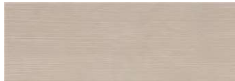
WAVE RESIN TORTORA