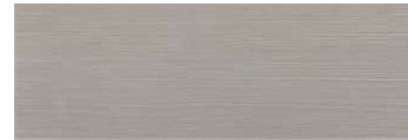
WAVE RESIN CONCRETE