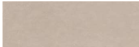
WAVE WALL TORTORA