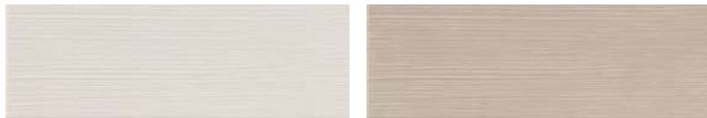
WAVE RESIN SNOW