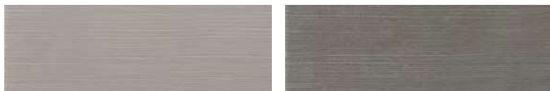
WAVE RESIN CONCRETE