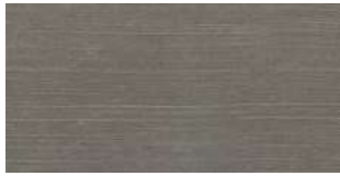
WAVE RESIN PLUMB

WAVE WALL CONCRETE 30x60 cm/11.8"x24" RC