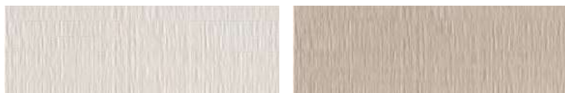
WAVE WOOD SNOW