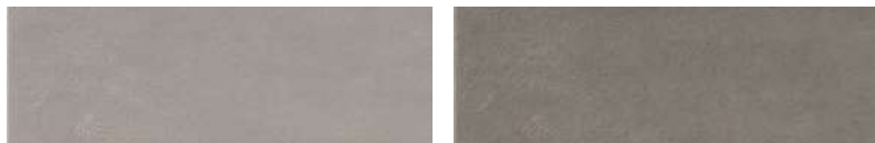
WAVE WALL CONCRETE