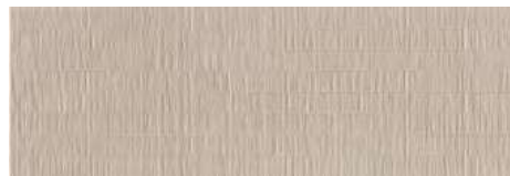
WAVE WOOD TORTORA

WAVE WALL TORTORA 40x120 cm/16"x48" RC ↘