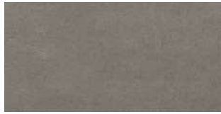
WAVE WALL PLUMB