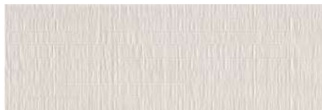
WAVE WOOD SNOW