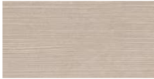
WAVE RESIN TORTORA