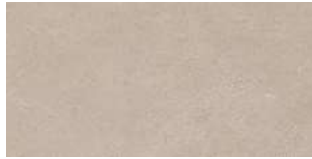
WAVE WALL TORTORA