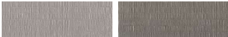
WAVE WOOD CONCRETE