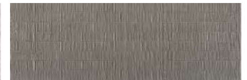
WAVE WOOD PLUMB

AVAILABLE FORMATS. / FORMATOS DISPONIBLES: