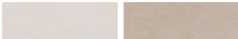
WAVE WALL SNOW