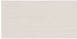
WAVE RESIN SNOW