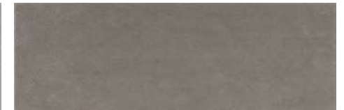
WAVE WALL PLUMB