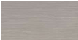
WAVE RESIN CONCRETE