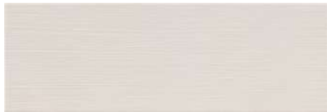
WAVE RESIN SNOW