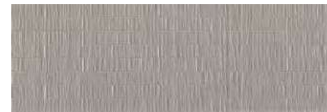
WAVE WOOD CONCRETE